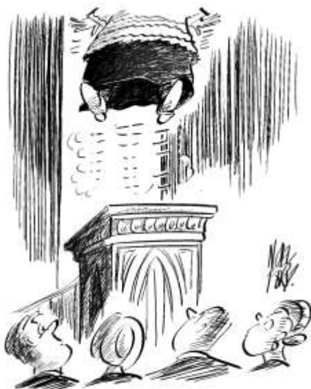
The fan-heater under the cassock idea proved not to be such a good one