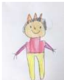
'Our wonderful Queen'

I sought the LORD, and He answered me and delivered me from all my fears.