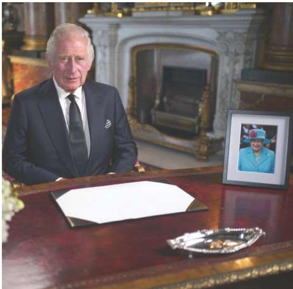
King Charles III - Yui Mok/PA

CAMELOT PARISHES WEBSITE - http://camelotparishes.co.uk/