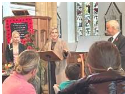
HRH the Countess of Wessex visits St Andrew's to learn about the project to welcome Ukrainian refugees.

with fellow Ukrainians, has also been really important, especially for those who are living out in the countryside and not near any fellow Ukrainians, and that has created a wonderful atmosphere.