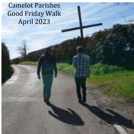
Camelot Parishes Good Friday Walk April 2023

Justin's martyrdom took place in the reign of Marcus Aurelius, along with six other believers. At his trial, whose authentic record survives, he clearly confessed his Christian beliefs, refused to sacrifice to the gods, and accepted suffering and death. As he had previously said to the emperor: “You can kill us, but not hurt us.”