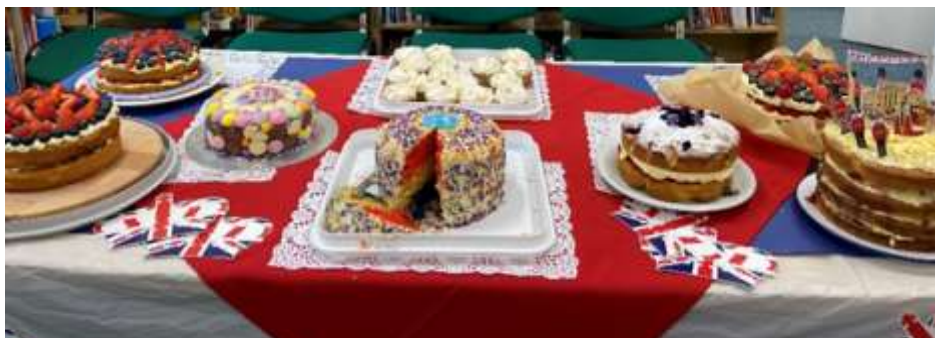
The winning bakes ...

Therefore please do share our GoFundMe link, or call us at school if you know of any businesses that might be looking for a worthwhile cause to support our