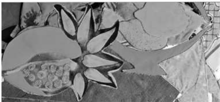
Still Life with Blue Jug - Inogen Blymer

Affordable Art from the best Regional Artists